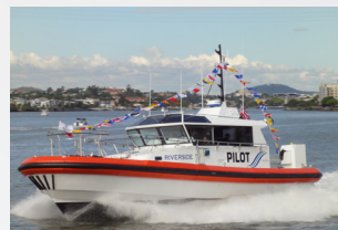
Alternative Fender Section (For Boarding Zone)