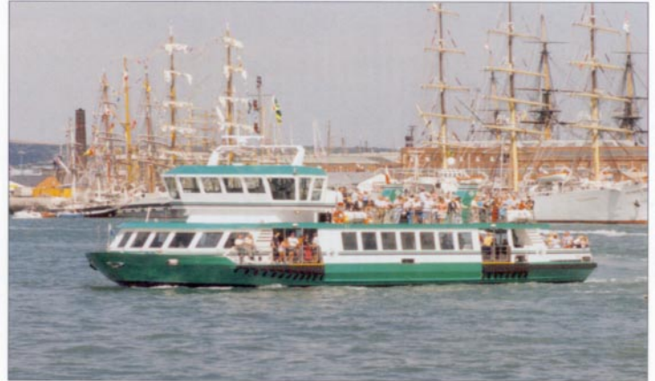
'Spirit of Gosport' at the International Festival of the Sea, August 2001.